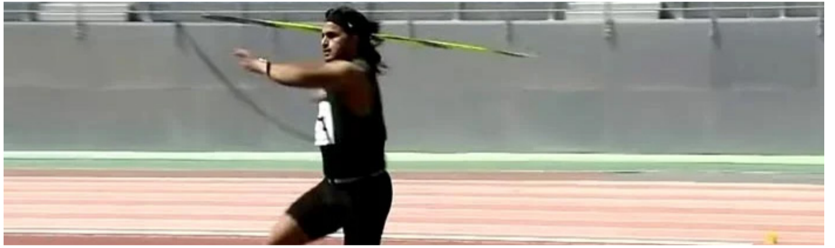
He will also not be participating in the upcoming Poland and Switzerland

Arshad is currently in the rehabilitation phase following surgery and is yet to regain full fitness. He underwent successful surgery on his calf muscles last month in Cambridge.