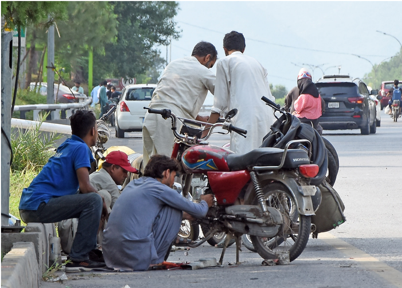
ISLAMABAD: Mobile motorcycle mechanics busy repairing motorcycles of people alongside Islamabad Expressway, in the Federal Capital.