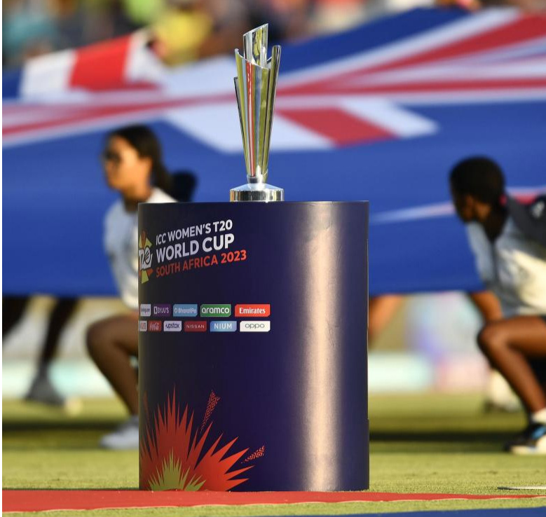
or Colombo, while the second semifinal is scheduled for October 30 in Navi Mumbai. The final, set for November 2,

As per the ICC, the first semifinal will be held on October 29 in either Guwahati