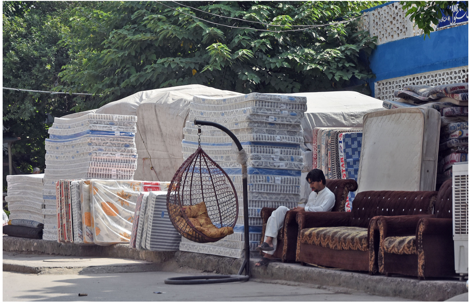
RAWALPINDI: A vendor is displayed secondhand mattress attraction for costumers at his roadside Mukha Singh State area, in the city.