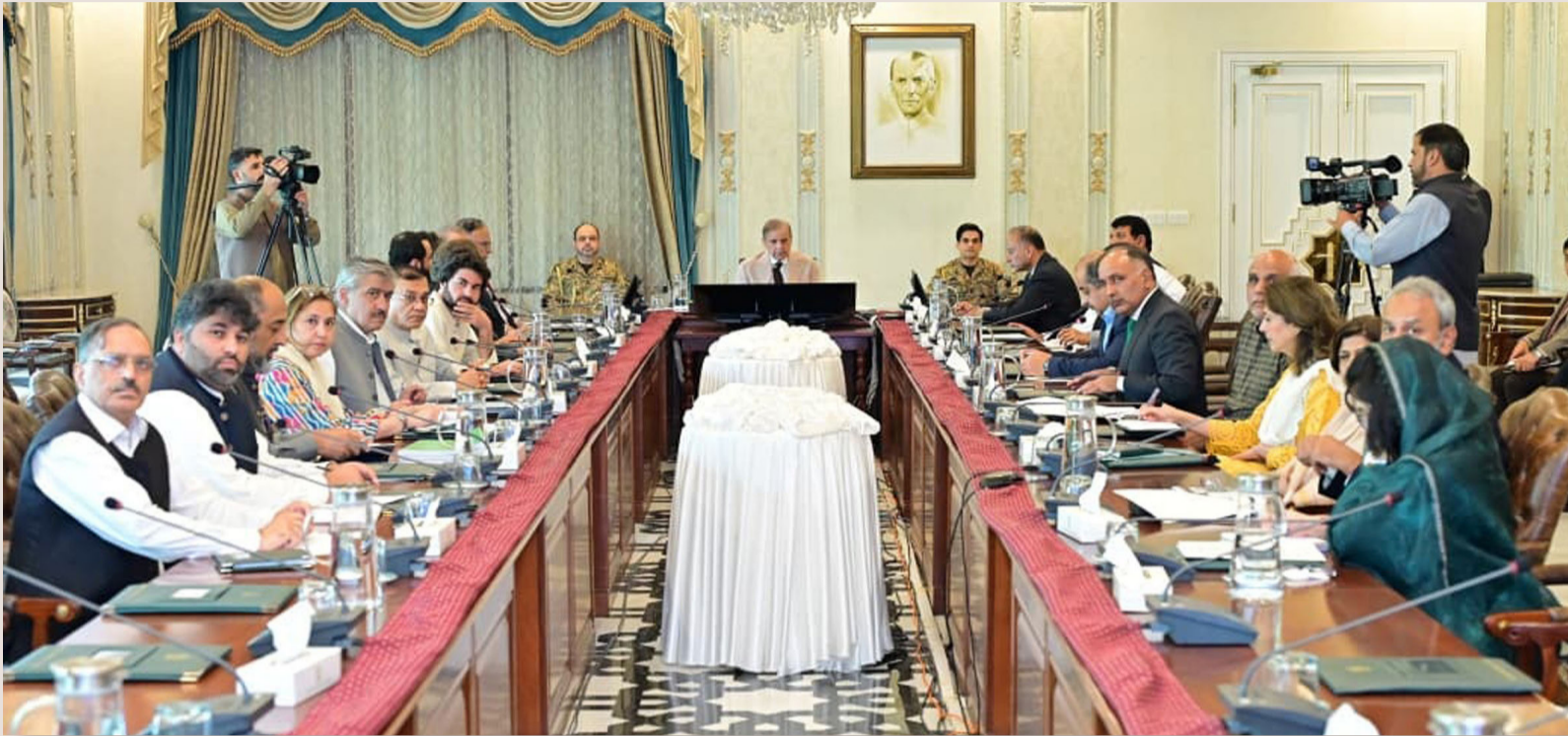
ISLAMABAD: Prime Minister Muhammad Shehbaz Sharif chairs a meeting to review relief operations during the torrential rains and floods, in Federal Capital.