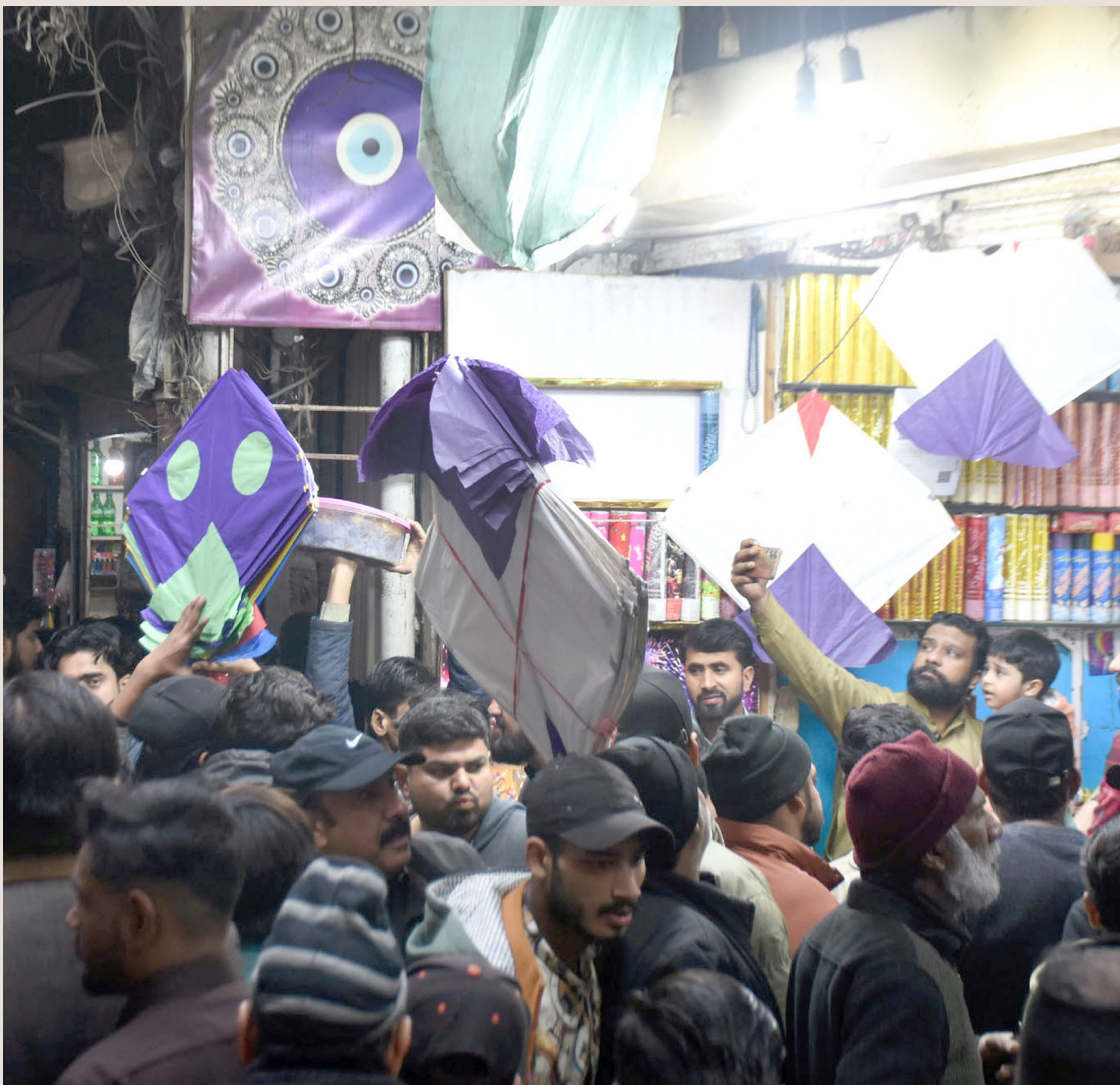
LAHORE: A large number of people are buying kites from shop at Mochi Gate Market, during preparation to celebrate "Basent Festival" in Provincial Capital, while Islamabad Capital Territory (ICT) Police have intensified their crackdown against kite sellers and flyers, registering 93 cases and seizing more than 17,000 kites and over 12,000 hazardous chemical strings as part of a zero-tolerance policy against the deadly practice.