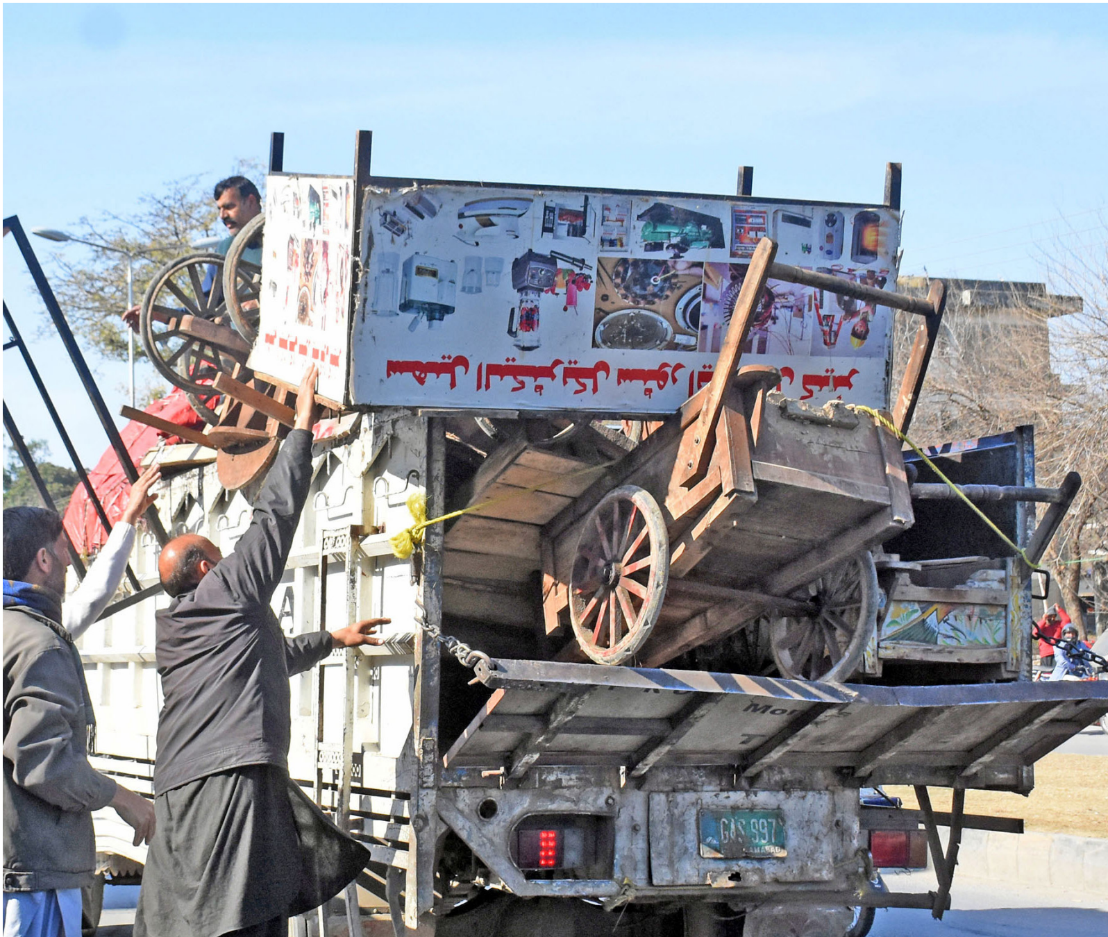
ISLAMABAD: Workers of Capital Development Authority (CDA) seized goods of shopkeepers during Anti-Encroachments Operation at Karachi Company area in Federal Capital.