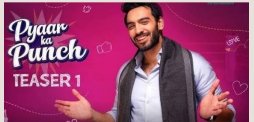
Entertainment. With a fresh on-screen pairing and a lighthearted Eid storyline, Pyar Ka Punch promises an entertaining experience for