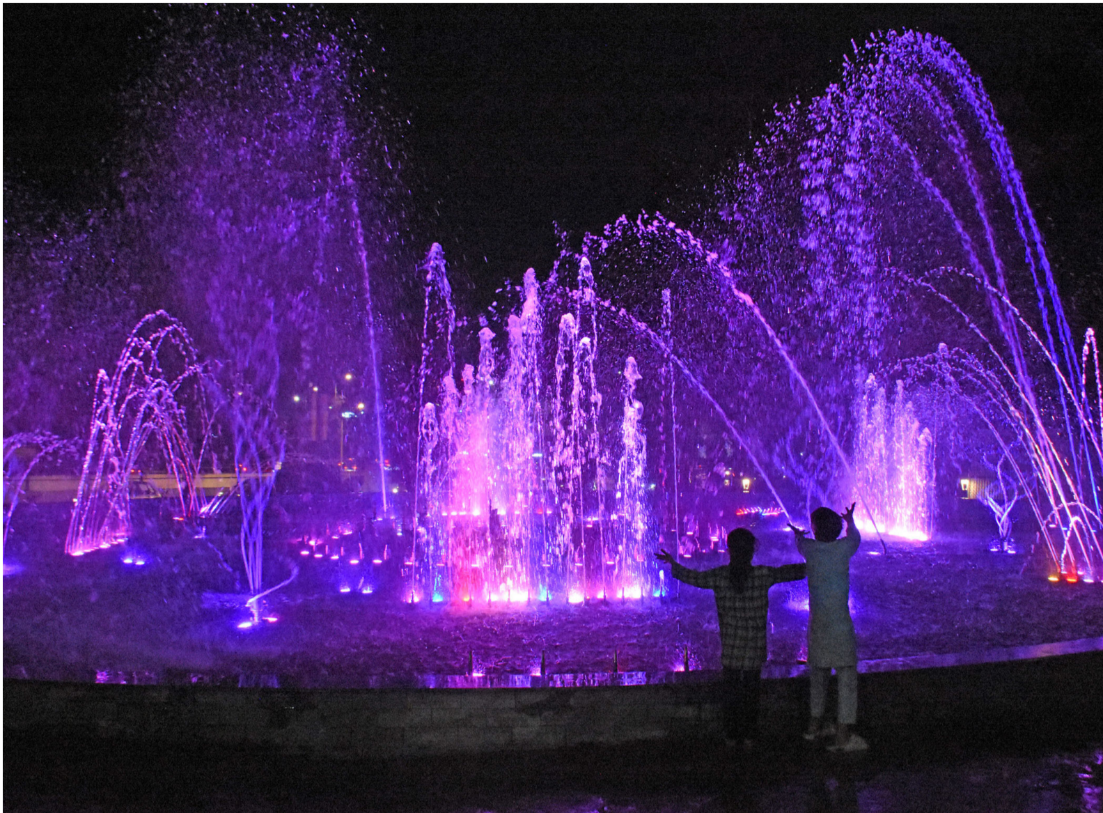
ISLAMABAD: Children are watching dancing fountain at a local park along Faisal Avenue in the Federal Capital.