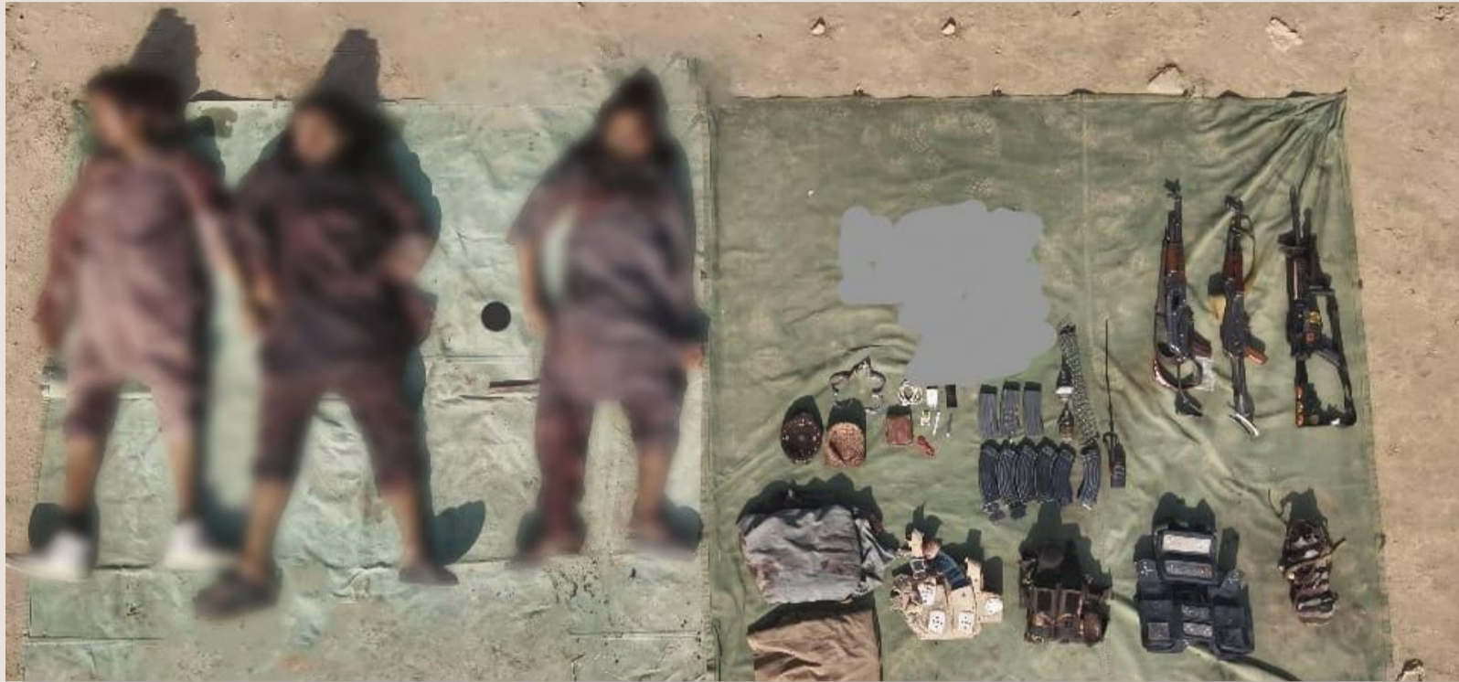
RAWALPINDI: Security forces gunned down five India-backed terrorists during an operation conducted in the Lakki Marwat district of Khyber Pakhtunkhwa.

During the meeting, the committee members will be briefed on the latest developments and progress in the investigations related to the Radio Pakistan incident that occurred on 9 and 10 May 2023.