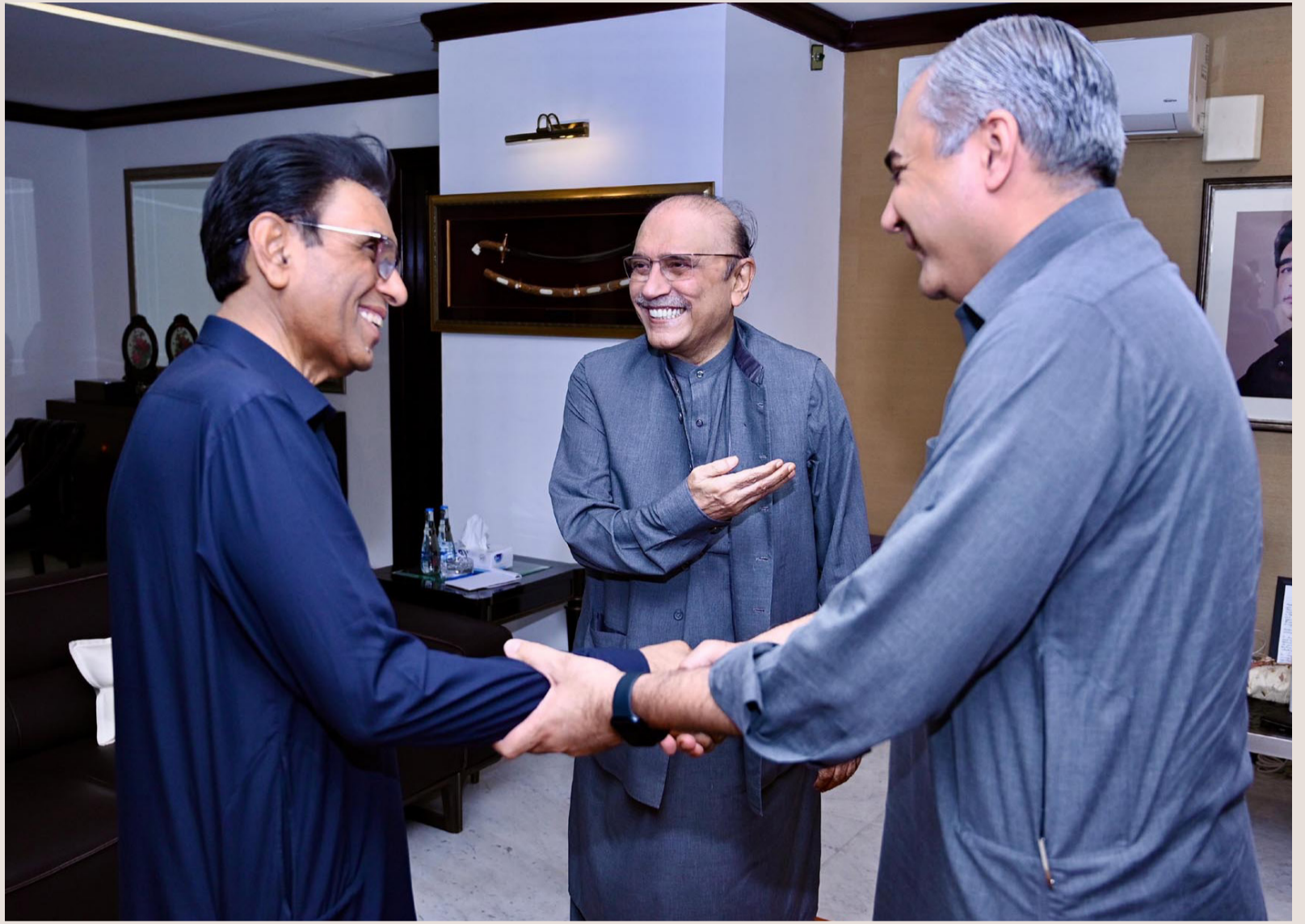
KARACHI: President Asif Ali Zardari meeting Federal Minister for Interior and Narcotics Control Syed Mohsin Naqvi and Chairman MQM-Pakistan Khalid Maqbool Siddiqui on Sunday.