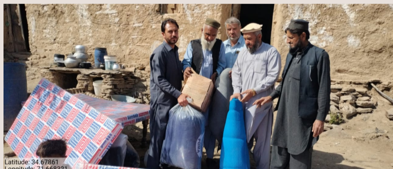
nied by local elders, visited the site of the incident and met with the affected family. He offered prayers for the deceased, inquired about the condition of the injured, and provided immediate relief goods to the family on behalf of the district administration.

BAJAUR: A tragic incident of a room collapse in the remote village of Gadamaar in Tehsil Barang resulted in the death of a woman, while one man and three children were injured. The district administration initiated relief measures immediately after the incident to assist and console the affected family. According to official sources, the incident occurred at around 3:30 a.m. in the village of Tangi, where a room suddenly collapsed. As a result, a woman died on the spot, while one man and three children sustained injuries. On the instructions of Deputy Commissioner Bajaur Shahid Ali Khan, the Naib Tehsildar of Barang, accompa-