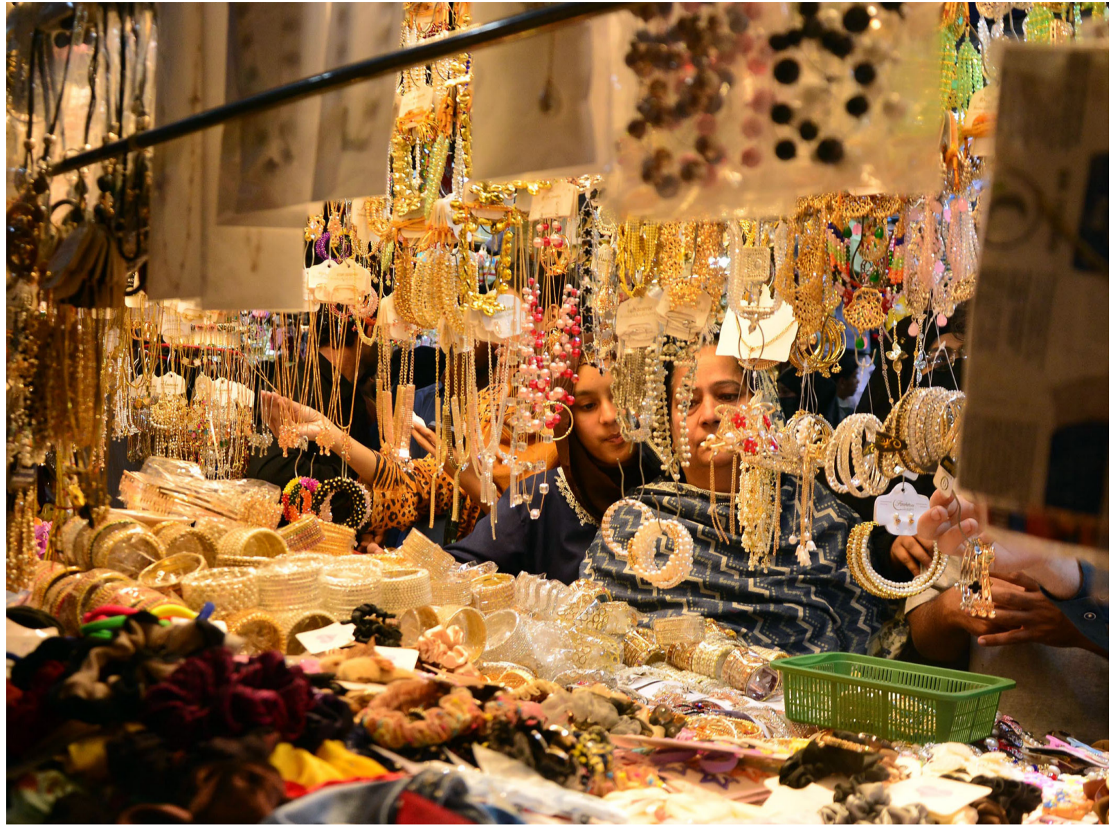
RAWALPINDI: Women are buying artificial jewellery to preparation upcoming Eid Ul Fitr festival at Sadar area in the city.

It is appealed that immediate funding should be announced through TDAP and EDF for organizing the global exhibition so that the preparations can be carried forward effectively.