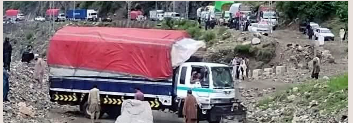
Sablomor: The closure has affected traffic, while reports have poured in about damage to vehicles travelling on road. Meanwhile, local administration and

The road has also been closed due to landslides in areas of Khidarnala and