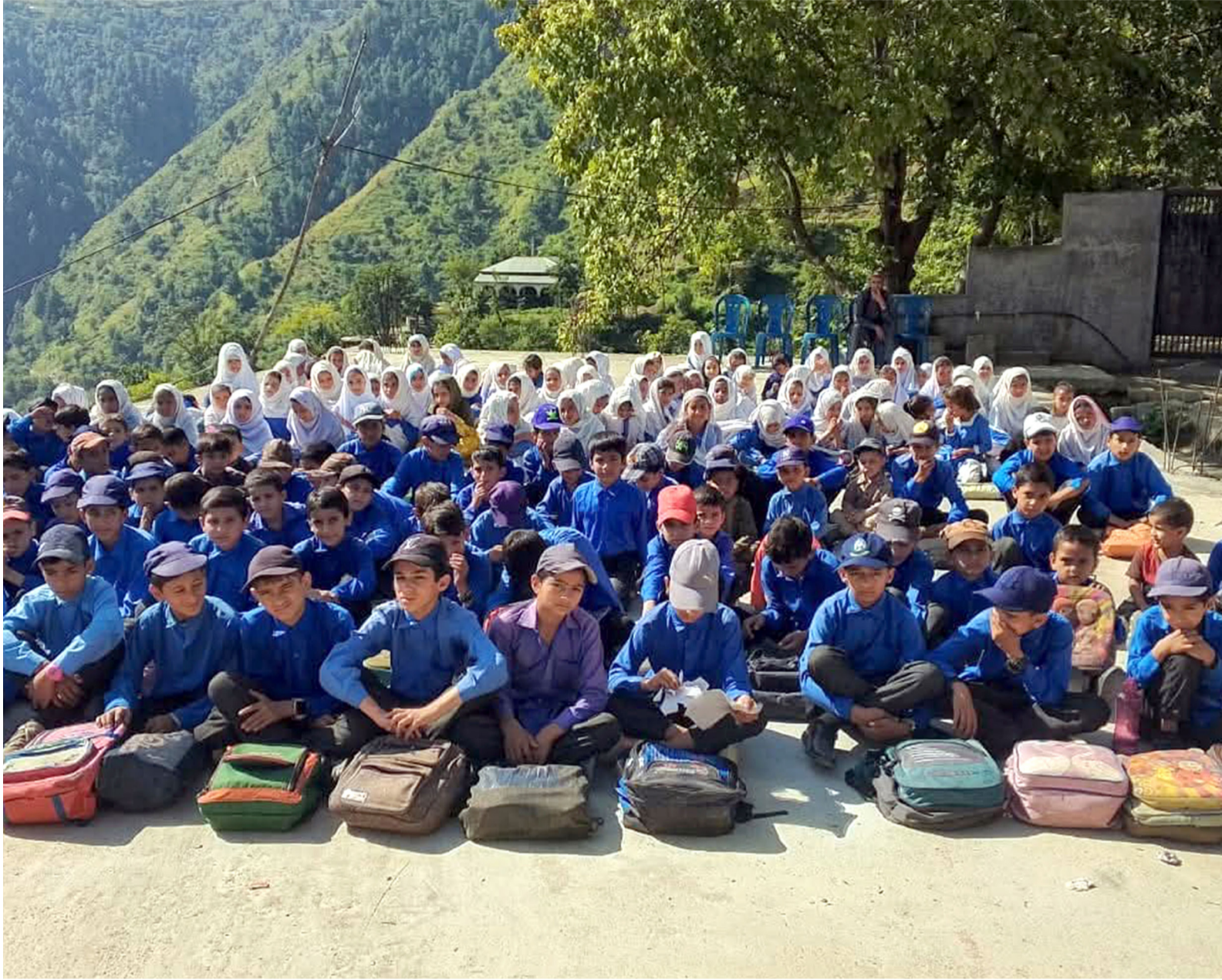
ABBOTTABAD: Students of the Government Primary School in Majhot, which was destroyed in the earthquake of October 8, 2005, are still studying under the open sky.