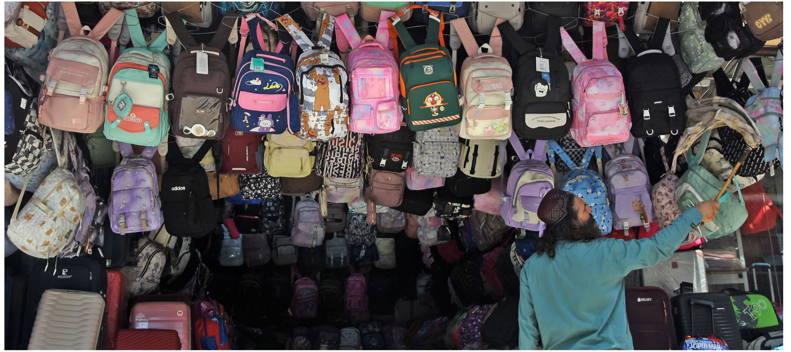
RAWALPINDI: A vendor is displaying school bags outside his shop at Iqbal Road in the city.

The company operates within the broader agribusiness and industrial sector and is involved in the production of fuel-grade and industrial-grade ethanol through value-added processing of agricultural raw materials.