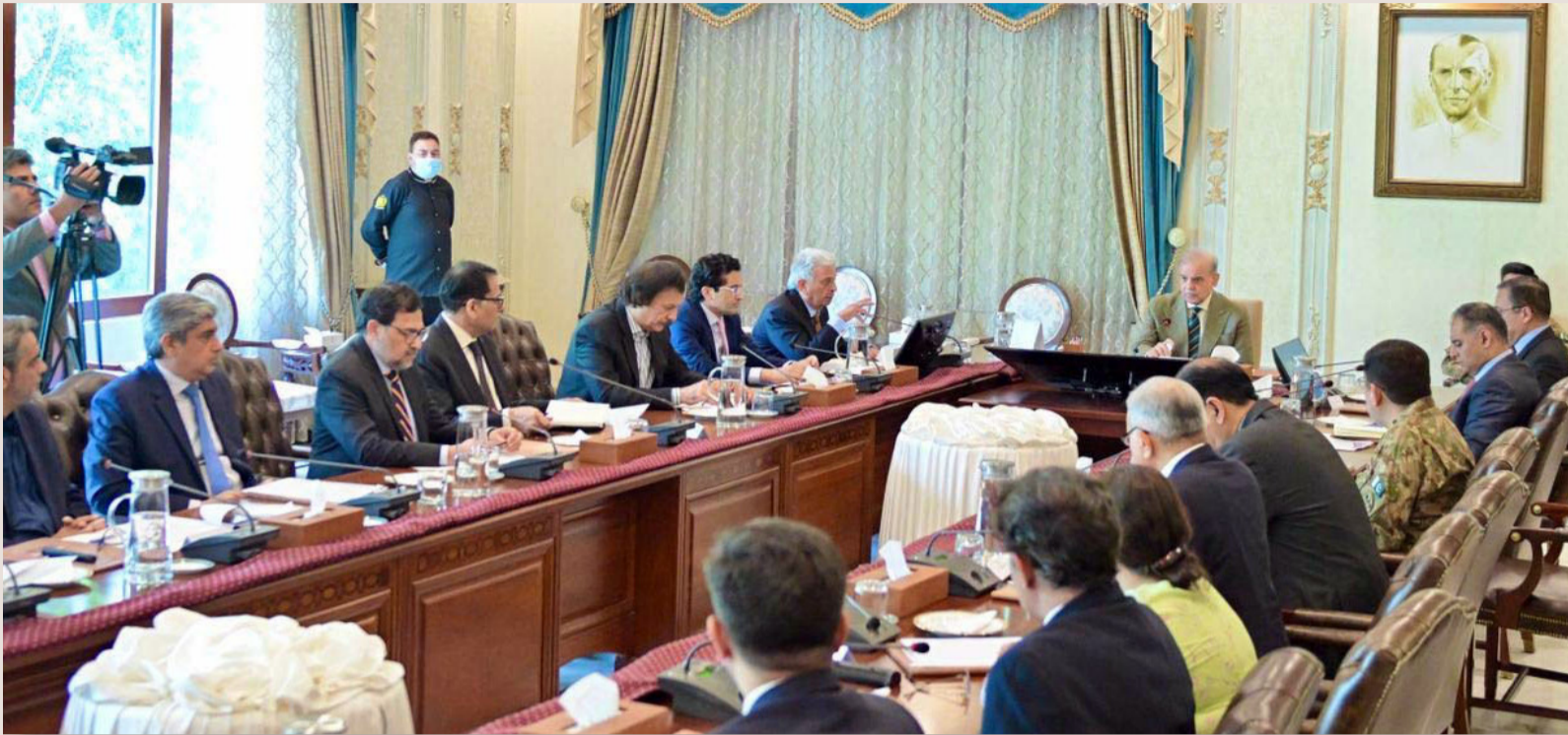
ISLAMABAD: Prime Minister Muhammad Shehbaz Sharif chairs a meeting regarding food security and availability of fertilisers in the Federal Capital on Tuesday.

Iran agreed to assist, and the two sides are coordinating the first vessel's safe passage carrying gas supplied under Pakistan's agreement with Qatar, its main LNG supplier, the source added.