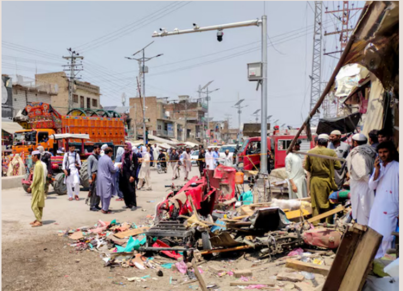
LAKKI MARWAT: People gather at the site of the blast near Naurang police station in Lakki Marwat district, Khyber Pakhtunkhwa on Tuesday.