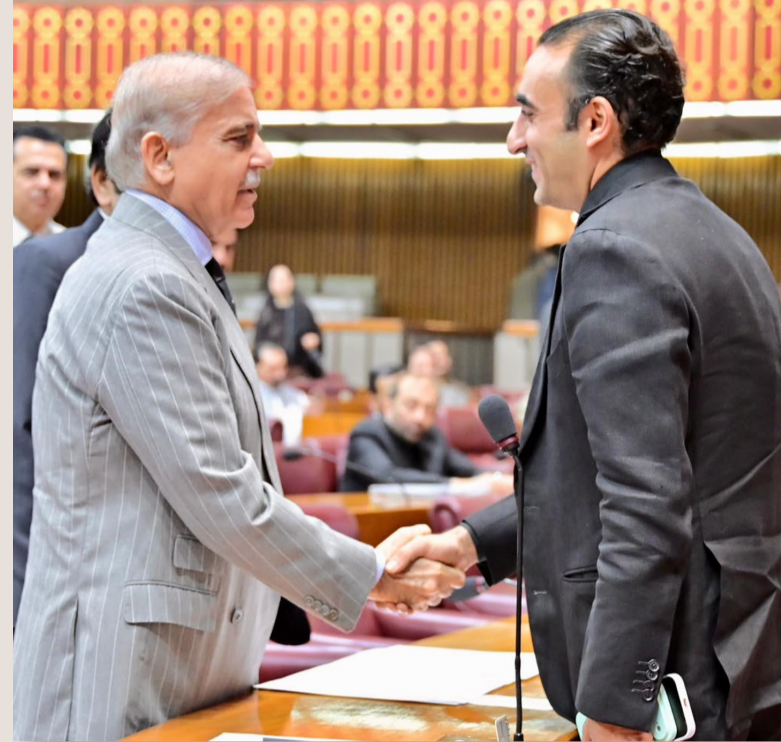
ISLAMABAD: Prime Minister Muhammad Shehbaz Sharif shakes hands with Chairman Pakistan People's party Bilawal Bhutto Zardari at the National Assembly in Islamabad.