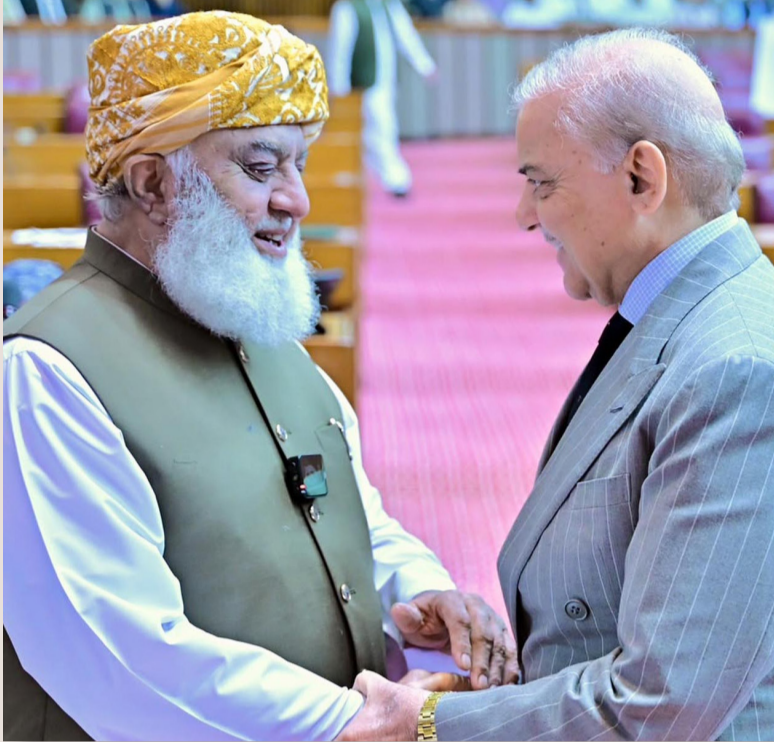
ISLAMABAD: Prime Minister Muhammad Shehbaz Sharif shakes hands with President JUI-F Maulana Fazl ur Rehman at the National Assembly in Islamabad.

The meeting was attended by Minister of State for Interior Talal Chaudhry, Secretary Interior, Additional Secretary Interior, Director General FIA, Commandant National Police Academy and Director General NCCIA.