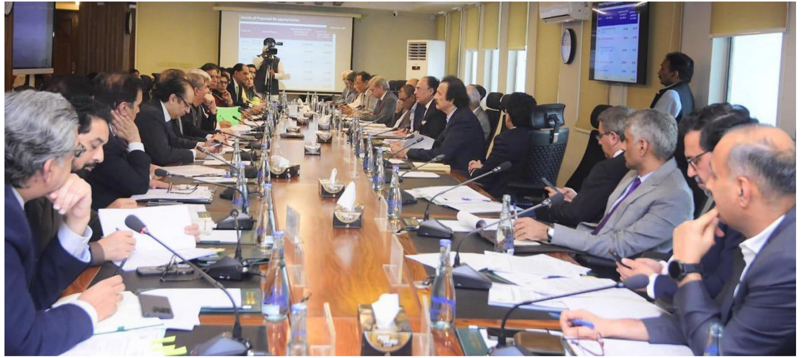
ISLAMABAD: Federal Minister for Finance and Revenue, Senator Muhammad Aurangzeb chairing a meeting of the Economic Coordination Committee at the Finance Division in Islamabad on Wednesday.

The Board reviewed the proposal under the provisions of the Public Private Partnership Authority Act, 2017, emphasizing compliance with procurement rules, transparency requirements, and value-for-money principles.