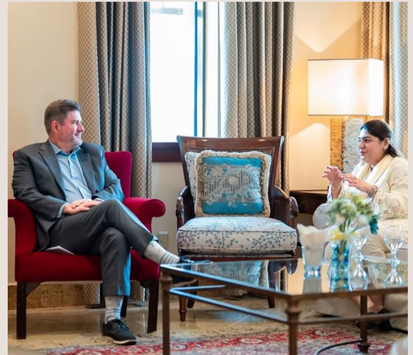
The gathering celebrated the achievements of the participants and underscored the lasting impact of educational and professional exchanges in promoting community development and international cooperation.