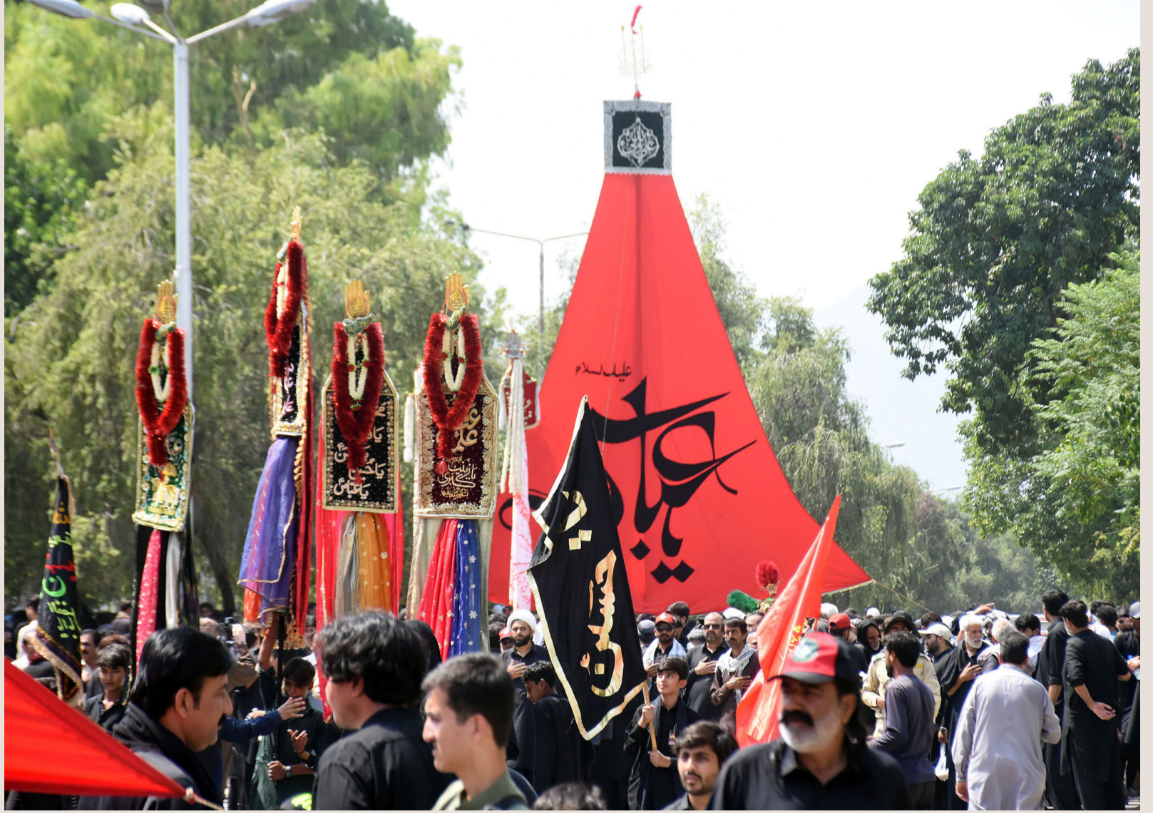
ISLAMABAD: Shiite Muslims take part in 8th Muharram ul Haram procession taken out Jamia Al-Murtaza (G-9/4) which concludes at Imambargah Imam Sadiq (G-9/2) in the Federal Capital.