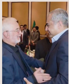
ISLAMABAD: Interior Minister Mohsin Naqvi met his Iranian counterpart, Dr Eskandar Momeni, on Wednesday, and vowed that Pakistan would continue its efforts for lasting peace in the Middle East.

According to a statement issued by the interior ministry, the two sides held detailed discussions on Pakistan-Iran relations and the latest regional situation following the peace agreement.